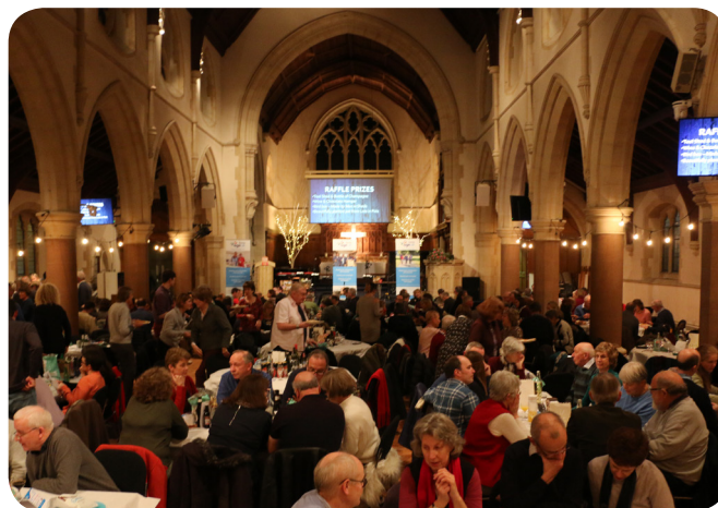
St Saviour's Church, Guildford