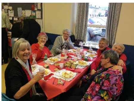
Friends, old and new enjoying the festive activities at Newcomen Hall.

Our Festive Lunch was held in Newcomen Methodist Church, Redcar and proved to be a great success. Everyone had a fun time, enjoying food kindly