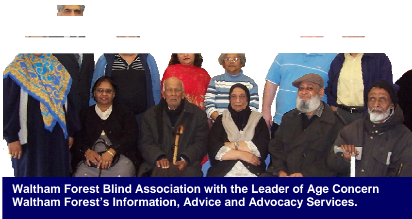
Waltham Forest Blind Association with the Leader of Age Concern Waltham Forest's Information, Advice and Advocacy Services.