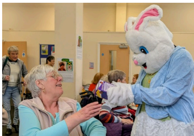
Fun, games and lots of chocolate, courtesy of the Easter Bunny