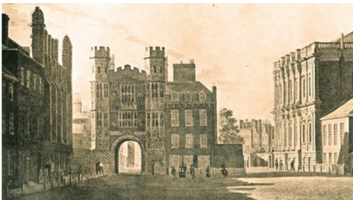
Palace of Whitehall in late 16 th century

This circular walk takes in the highlights of the Whitehall area, including hearing about the Cromwellian spy whose name is given to the most famous street in the world and that street's connection with a Mr Chicken. You will hear the story behind the pelicans in St James's Park and the story of Duck Cottage amongst other more famous sights. Cost is £5, booking is essential. (2 hours)