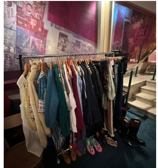
Re-loved club at the Soho Theatre