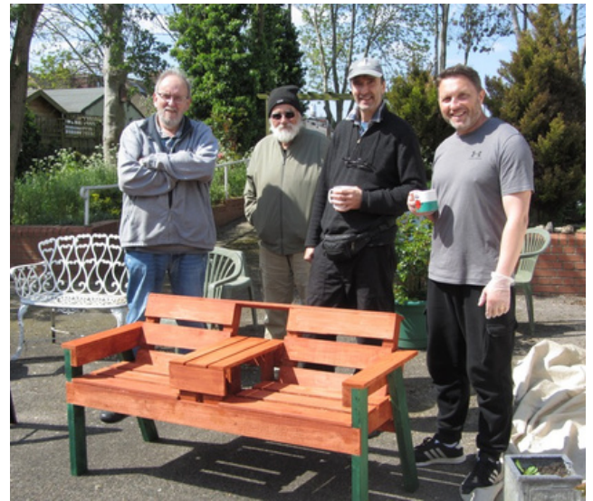
Our Shedders proudly present their hand-made bench