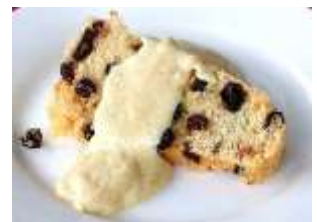
Spotted Dick and Custard