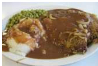
Liver and Bacon Casserole