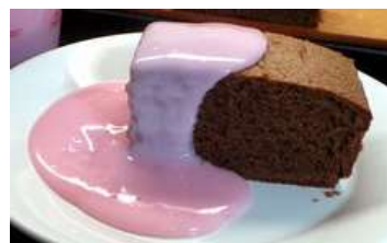
Chocolate Sponge and Pink Custard

Last Week's Spot the Difference Answers: These were 20 differences to spot