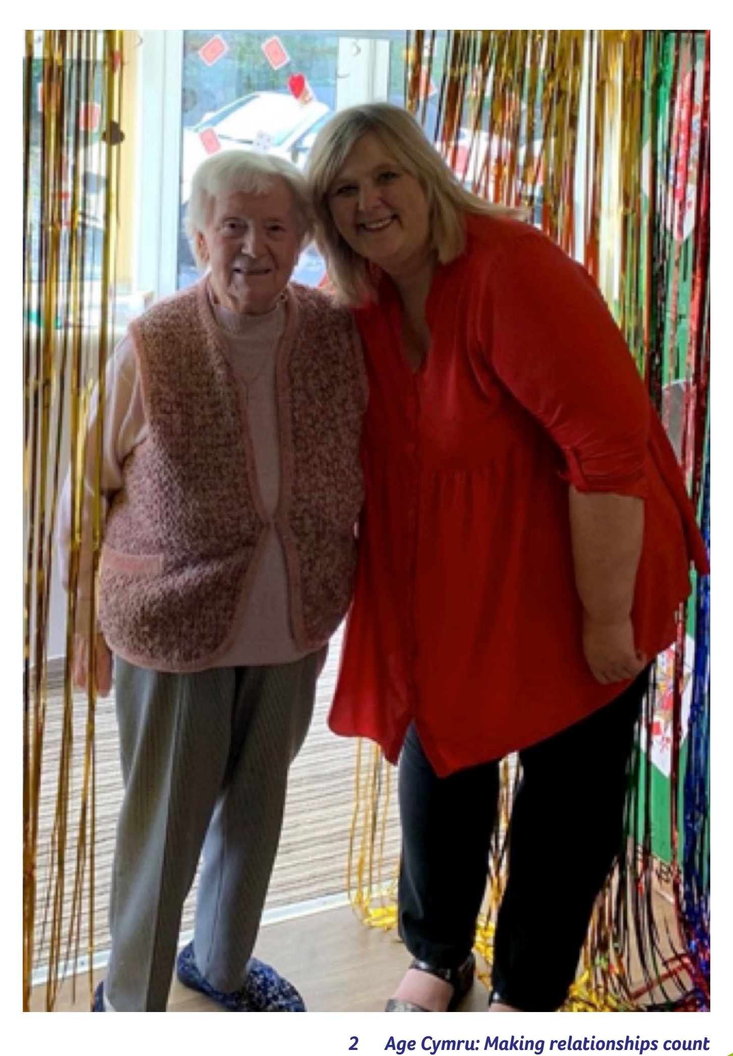
Age Cymru: Making relationships count