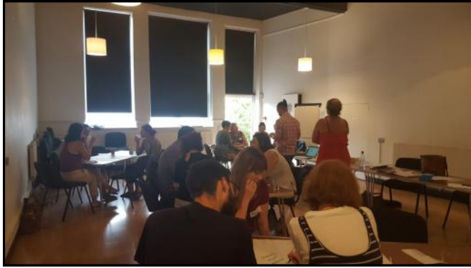
Speed-dating for sharing and challenging exhibition ideas

In July, the whole cARTrefu Team got together for a day of training, ideas-sharing and catching up. As the cARTrefu artists and mentors are based all across Wales, the Forums are an opportunity to come together and share best practise. We were able to utilise digital technology to catch up with our artists and mentors who couldn't make it on the day.